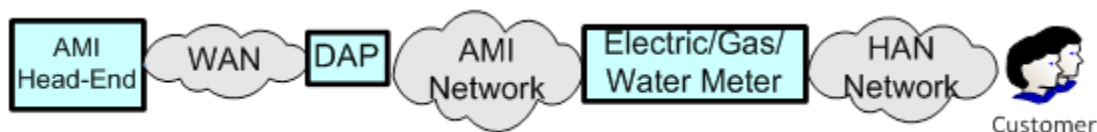
Figure 2: High level example of an AMI system