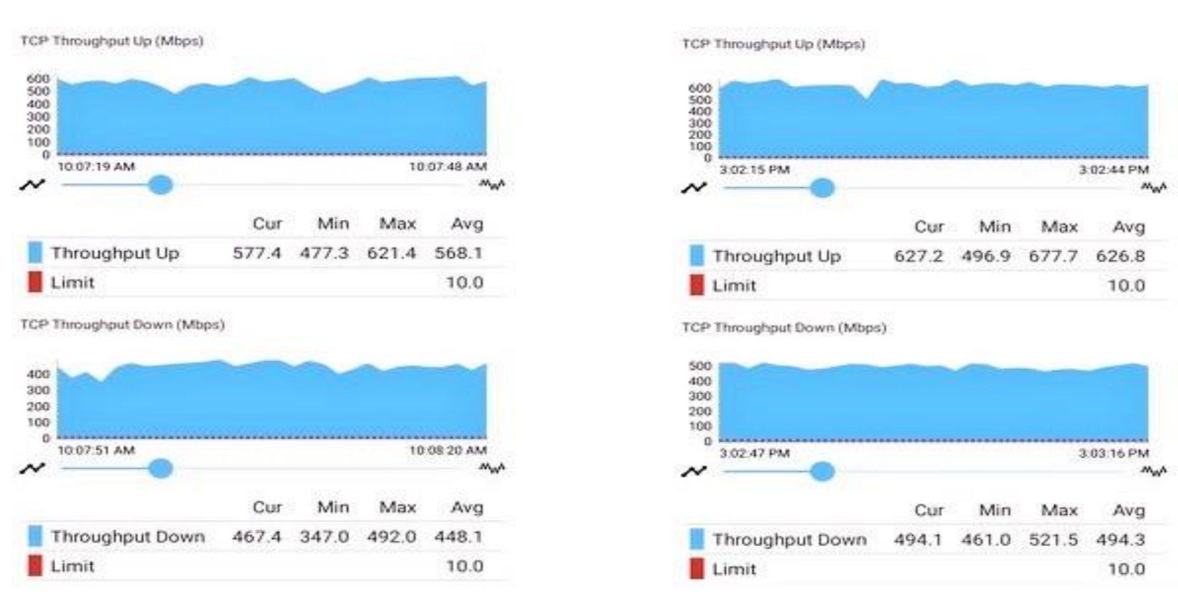
No Statistically Significant Difference in Up or Down Throughput