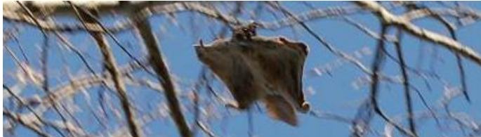
Figure 1: CRG Ballistic Trajectory Advisor at Work