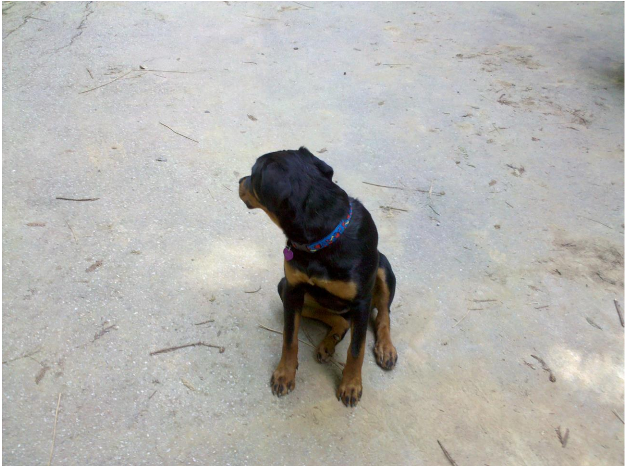
Figure 1: Squirrel?