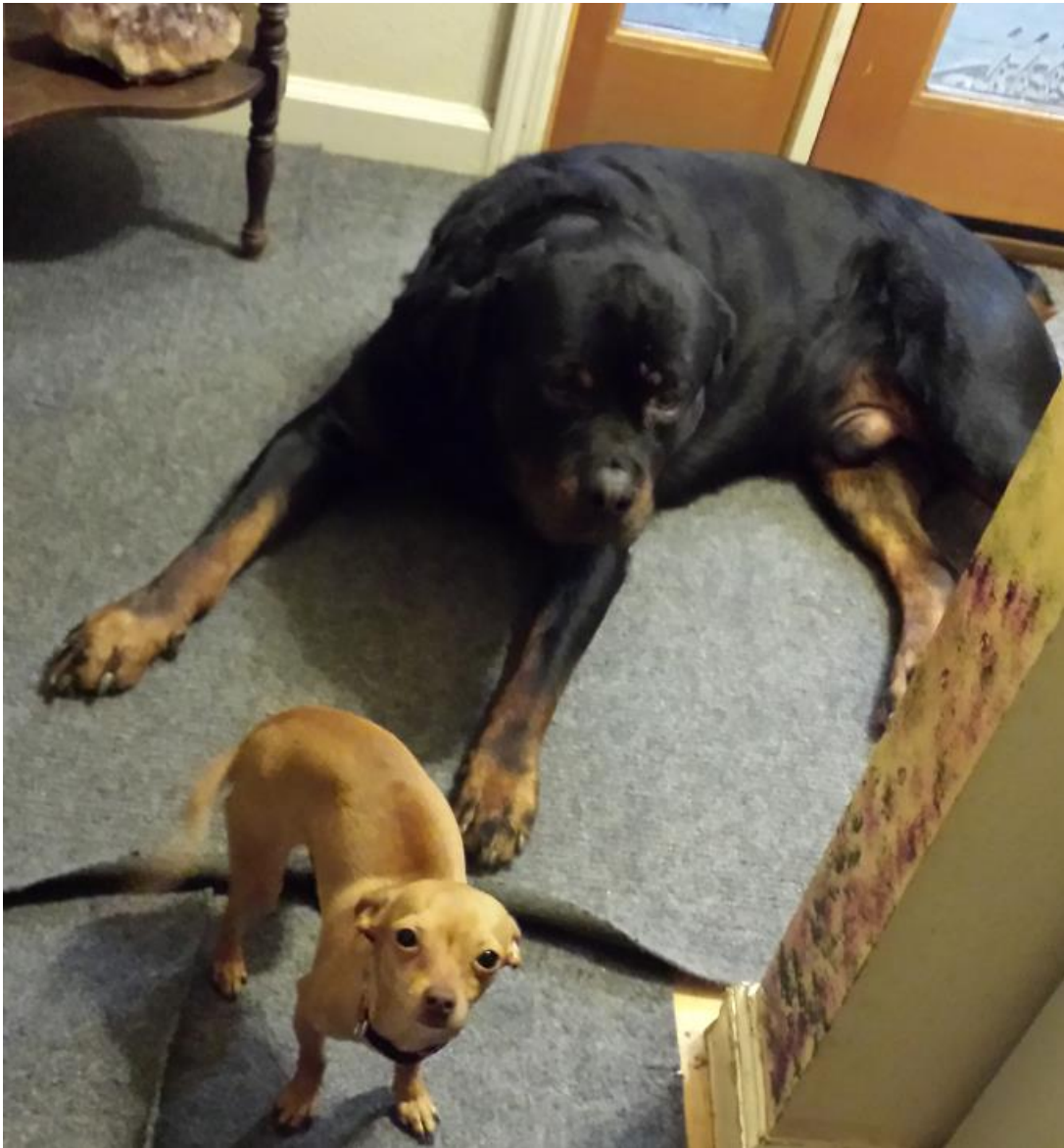
Figure 1: Good Coexistence Scenario