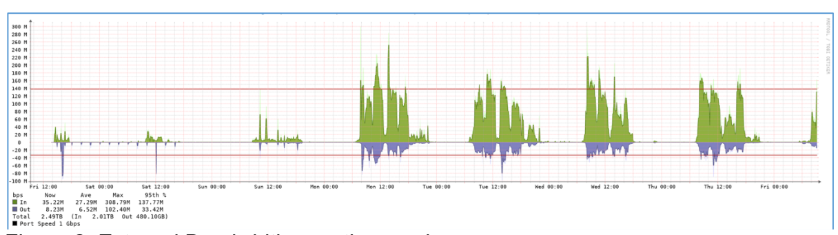
Figure 2. External Bandwidth: meeting week.