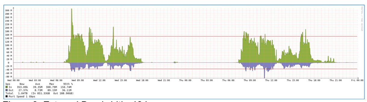
Figure 3. External Bandwidth: 48 hours.