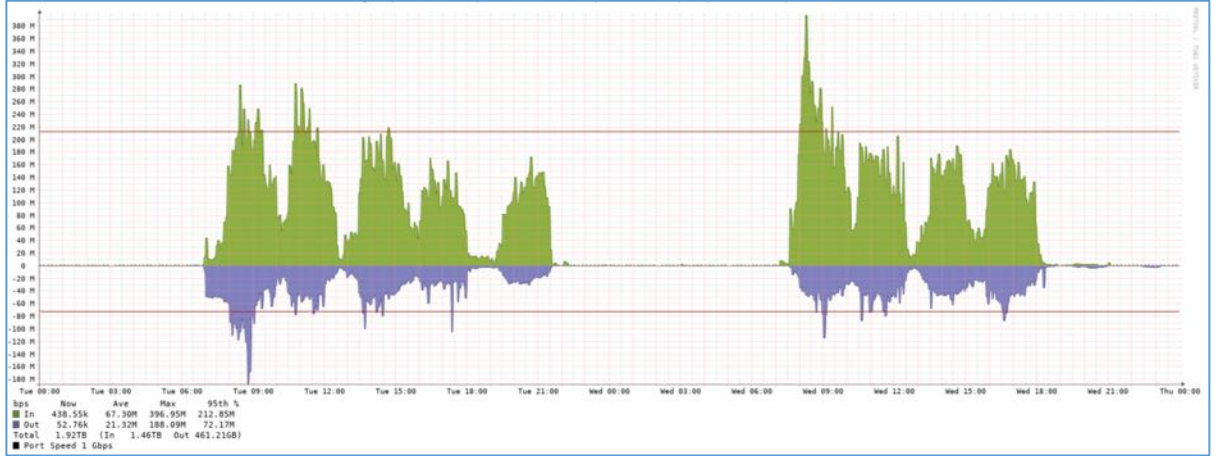
Figure 3. External Bandwidth: 48 hours.