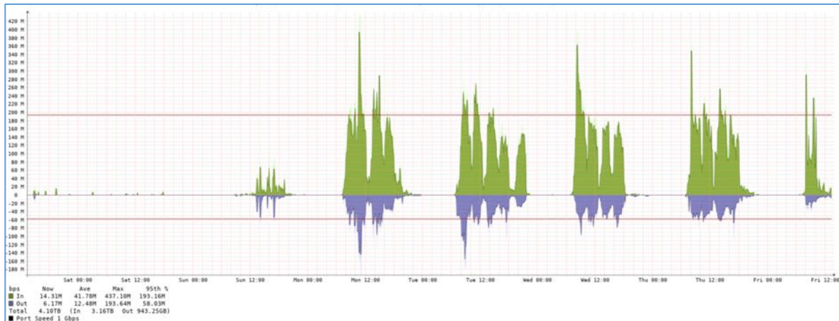
Figure 2. External Bandwidth: one week.