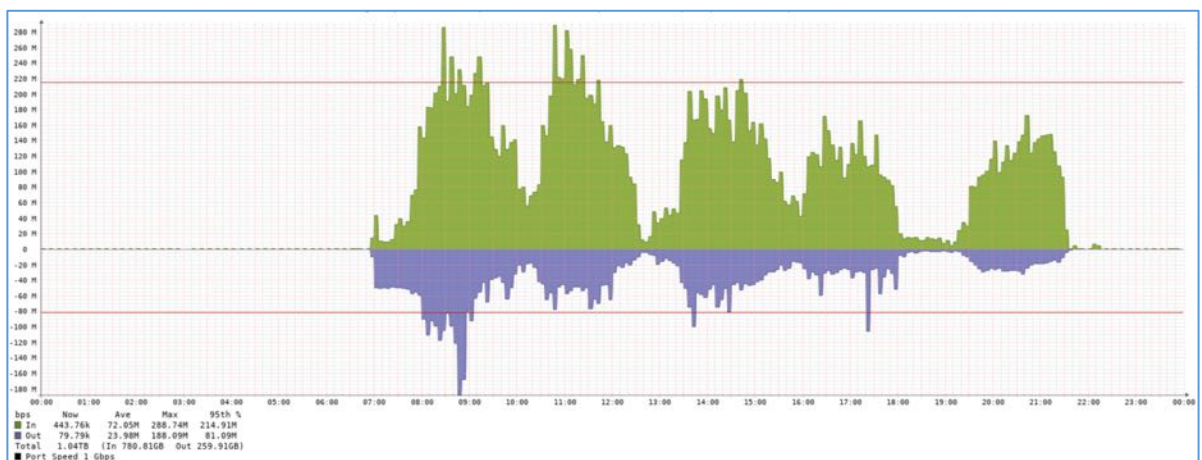
Figure 4. External Bandwidth: 24 hours.