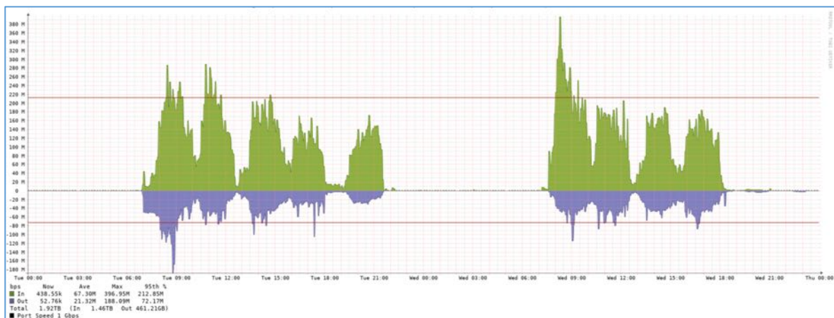
Figure 3. External Bandwidth: 48 hours.