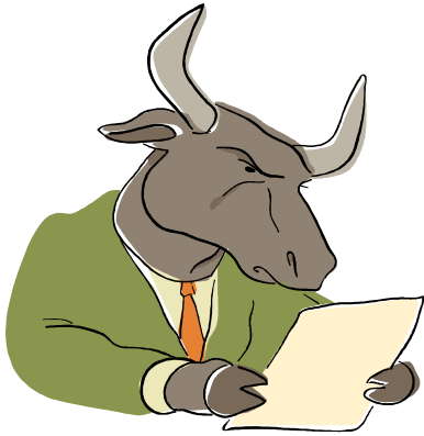
Broad Market Potential